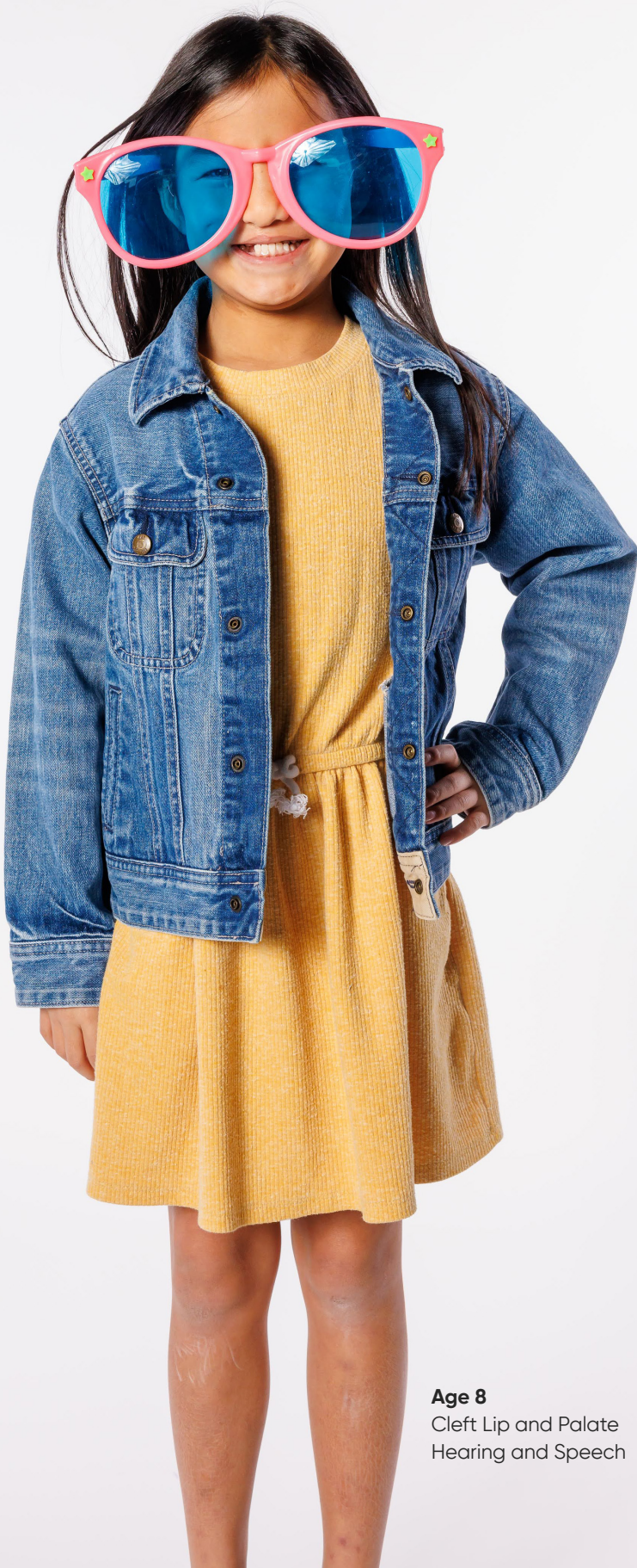
Age 8 Cleft Lip and Palate Hearing and Speech