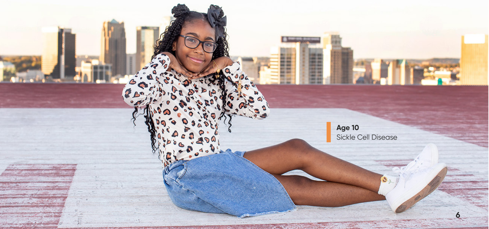
Age 10 Sickle Cell Disease